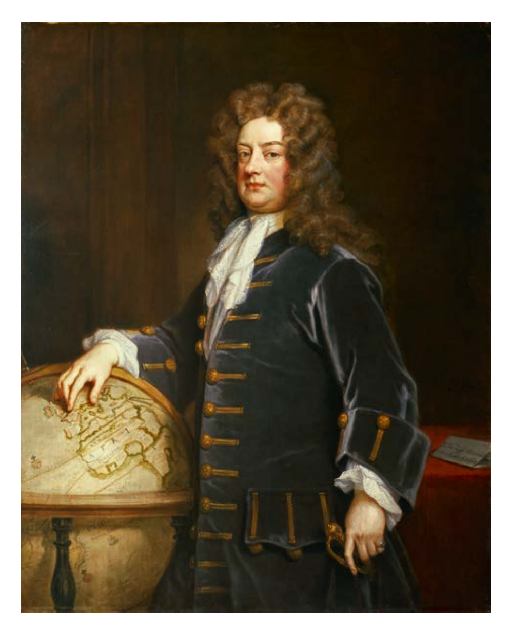
Fig. 1 Admiral Edward Russell, 1st Earl of Orford, c.1710, portrait by Godfrey Kneller and detail of the large diamond ring on the little finger of his left hand, a choice seen in portraits of men of different social classes. Caird Fund, Royal Museums Greenwich BHC2992 © National Maritime Museum, Greenwich, London https://collections.rmg.co.uk/collections/objects/14465.html

Diamond rings, today often considered a female form of jewellery, were widely worn by men across the middle and upper classes in eighteenth century Europe. This can be seen across a range of written sources, including wills, legal proceedings and literature as well as in visual sources such as paintings and engravings. Male portraits often show the gleam of a diamond ring on the sitter's little finger. Examples like Admiral Sir Edward Russell (fig. 1); the writer sitting at his desk in Jean Etienne Liotard's L'Ecriture (1752); John Sharp, the Archdeacon of Durham by Thomas Hudson (1757)<sup>2</sup> and George III (fig. 2) painted by Thomas Gainsborough (1780), are all posed to show off their diamond rings. While this is probably in part an artistic device, a way of adding a point of light and visual interest to the picture, it also reflects a pattern of use, suggesting that these jewels were important to the wearer and were used to help create the sitter's chosen self-image.